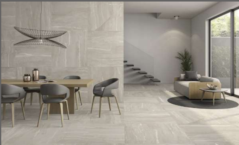
Total Tiles & Surface Solutions