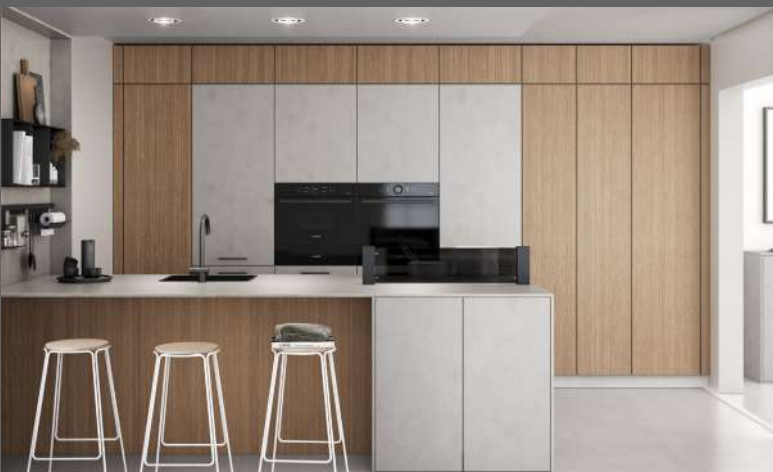
Total German Kitchen Solutions