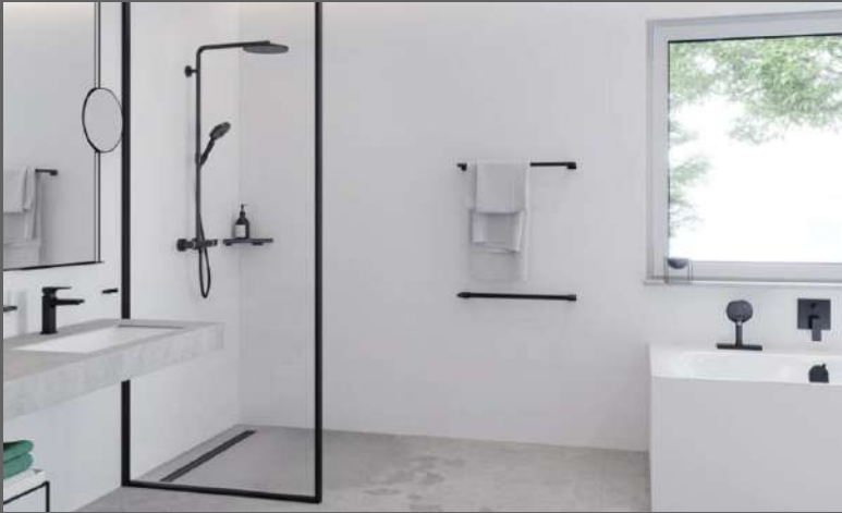
Total Bathroom Solutions